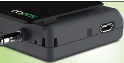
Integrated micro USB port