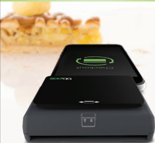
Facilitates secure and easy payment transactions